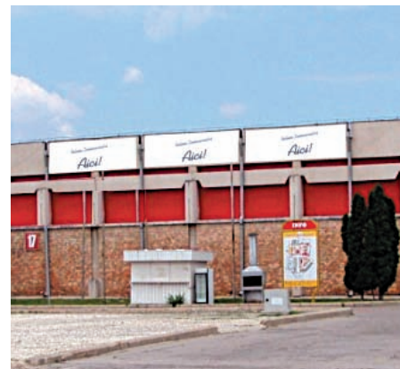
BANNER DISPLAY ON PAVILION C5 FACADE