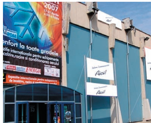
BANNER DISPLAY ON PAVILION C1 FACADE