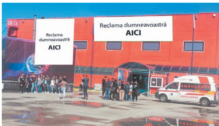
BANNER DISPLAY ON PAVILION C6 FACADE