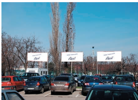
BANNER DISPLAY AT PARKING-GATE B