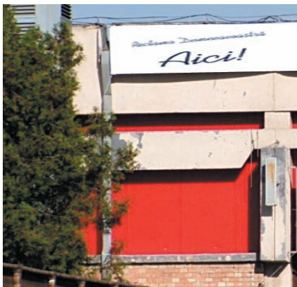
BANNER DISPLAY ON PAVILION C4 FACADE