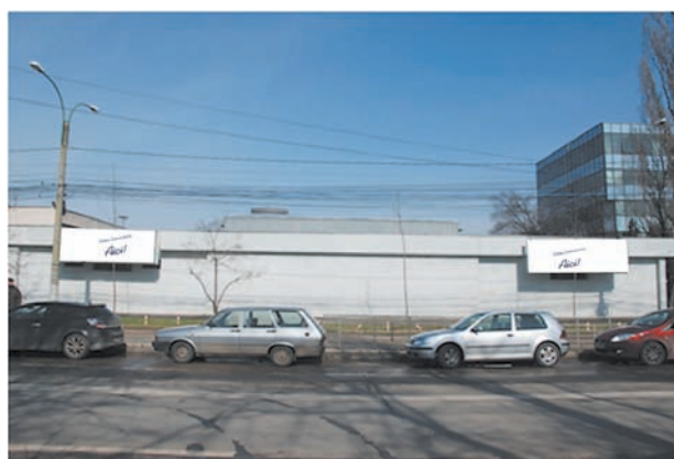
BANNER DISPLAY ON ROMEXPO HEADQUARTER FACADE