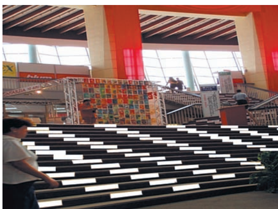
STICKERS DISPLAY ON PAVILION'S STAIRS AND FLOOR