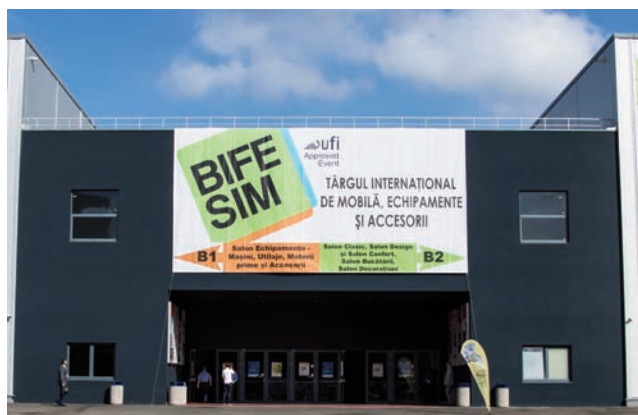
BANNER DISPLAY ON PAVILION B3 FACADE