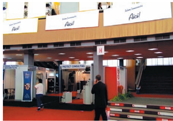
BANNER DISPLAY ON PAVILION A, FRIEZE 4.50