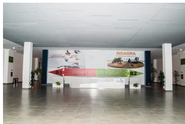
BANNER DISPLAY INSIDE PAVILION B3, AT THE INFO DESK