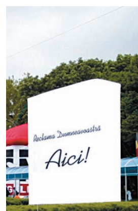
ADVERTISING MASCOTS DISPLAY